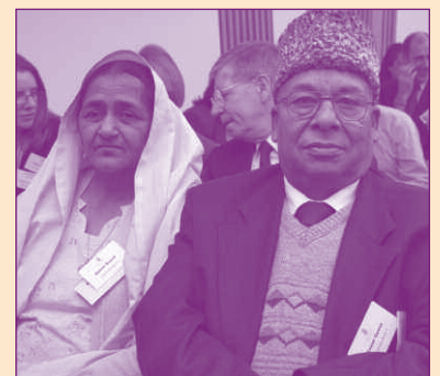
Easy Guide to Benefits for the 60+ Launch